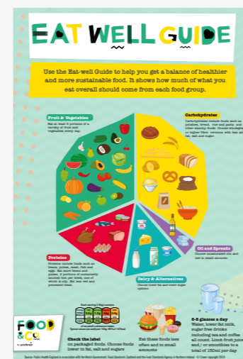
Foodie Fun Days taster session toolkit for cooks

To raise awareness of the benefits of healthy eating, our kit also includes tools based on the Public Health England Eatwell Guide healthy eating model.