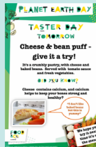
A poster promoting a taster session

Through these sessions, we demonstrated how we cook food from fresh in our kitchens, helping us build trust and relationships with people across the whole school community.