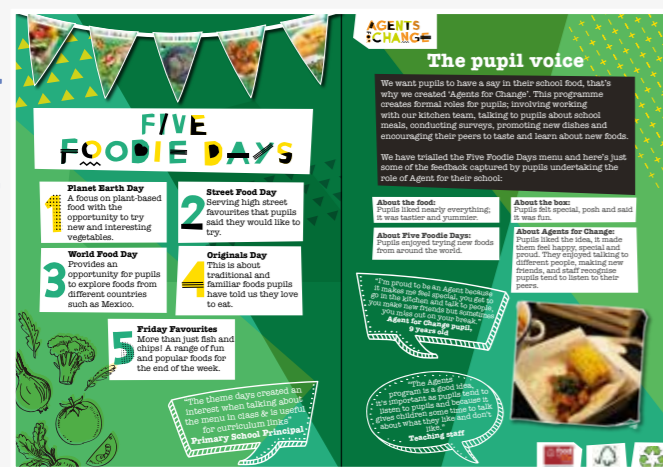
Parent flyer introducing the new menu

The Principal stressed we shouldn't change the menu back, but advised we engage parents to enable the pupils to benefit fully from the new offer. So, we prepared a flyer for parents, telling the story of how we developed Five Foodie Days, from concept to completion, and sent it home with pupils, along with copies of the new menu.