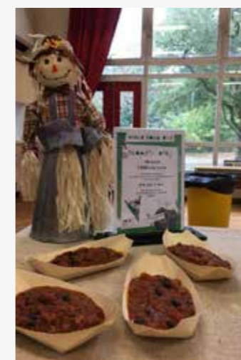
A taster dish for pupils to try during a session

Aimed at educating young palates and bridging the flavour gap, our craft chefs and cooks said about these taster sessions: