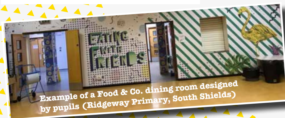
Example of a Food & Co. dining room designed by pupils (Ridgeway Primary, South Shields)

The school identified pupils to act as Agents for Change, who proved invaluable in engaging with parents and our on-site team, gathering feedback from their peers and promoting the food.