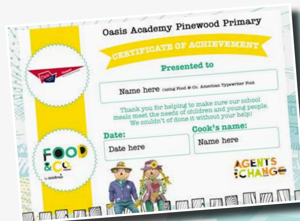
A certificate thanking Agents for their work

This generated ownership and boosted pupil engagement, which helped increase meal uptake. Going forward, it will also give us valuable insight that will allow us to continually tailor and improve our offer based on pupils' needs and views. Additionally, it fits with Ofsted and the school curriculum by giving pupils a meaningful voice and encouraging responsible behaviour.