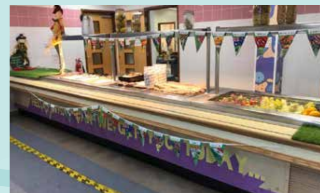
Food & Co. decorated primary school counter

We'll continue to monitor our sales and uptake data, gathering feedback and reviewing the menu accordingly, all of which will inform future changes to the menu.