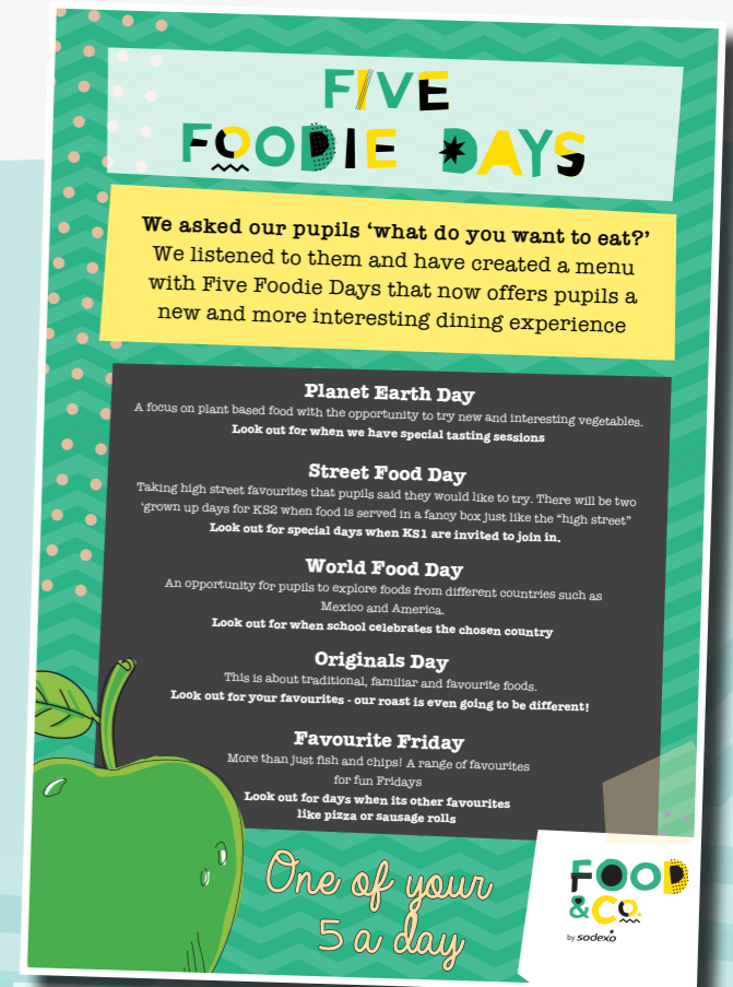
Poster explaining the Five Foodie Days