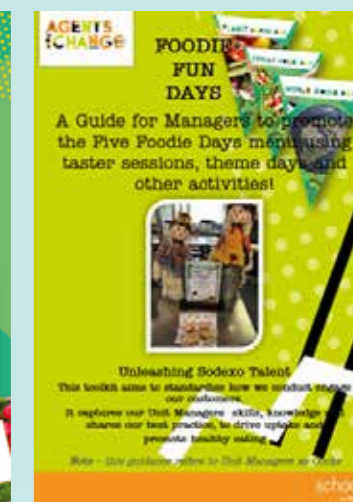
Child-friendly Eatwell Guide poster