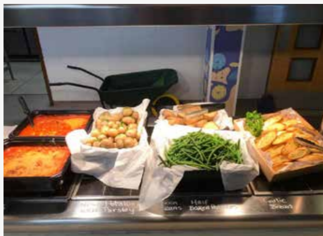
A typical counter serving school meals

We're excited about the change and look forward to seeing the schools and pupils reaping the rewards of our insight and efforts. Our on-site teams accepted the challenge of introducing a new menu and dishes, and the need to develop their cooking skills, and are excited about helping future generations benefit from improved food experiences at school.